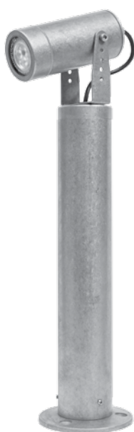
Diameter 6 cm and height 45 cm

BODY Aluminum profile and aluminum luminaire SOURCE Chip On Board (COB) LED VOSSLOH ActiveLine LED Module • OSRAM PrevaLED Coin 50g2 Module (ON BOARD) REGULATION Manufactured in accordance with EN 60598-1 and CE 93/68/EOK PROTECTION DEGREE AGAINST MOISTURE AND DUST IP65 • FOCUS DOWN LED LUMINAIRE